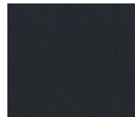
Atlantic blue SF197